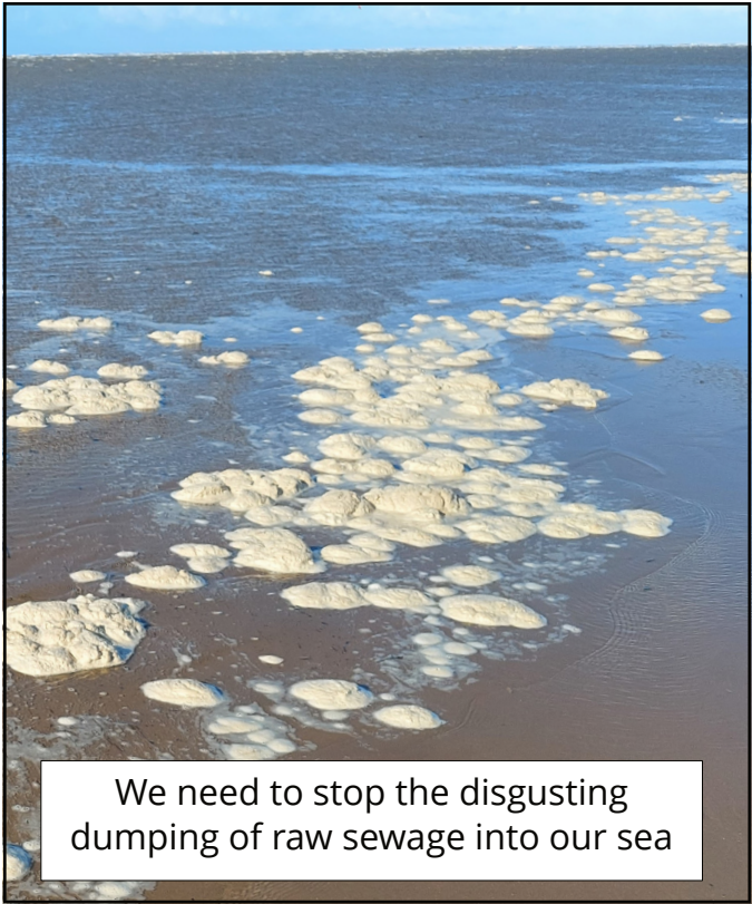
We need to stop the disgusting dumping of raw sewage into our sea