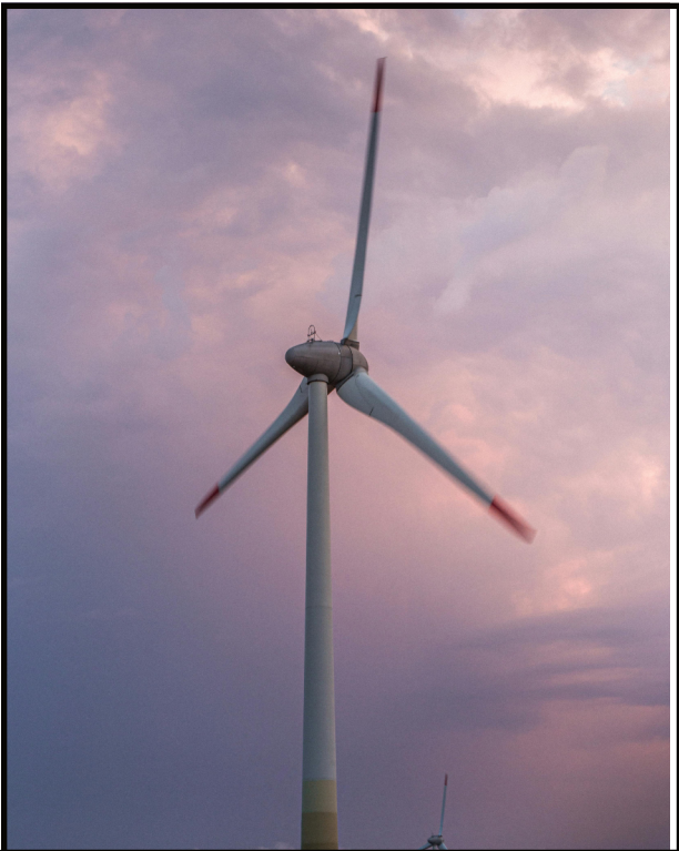
We all want the wind farm to progress, but we need an alternative cable route

“You can be assured I will fight on behalf of Kilgrimol residents against the current proposals”