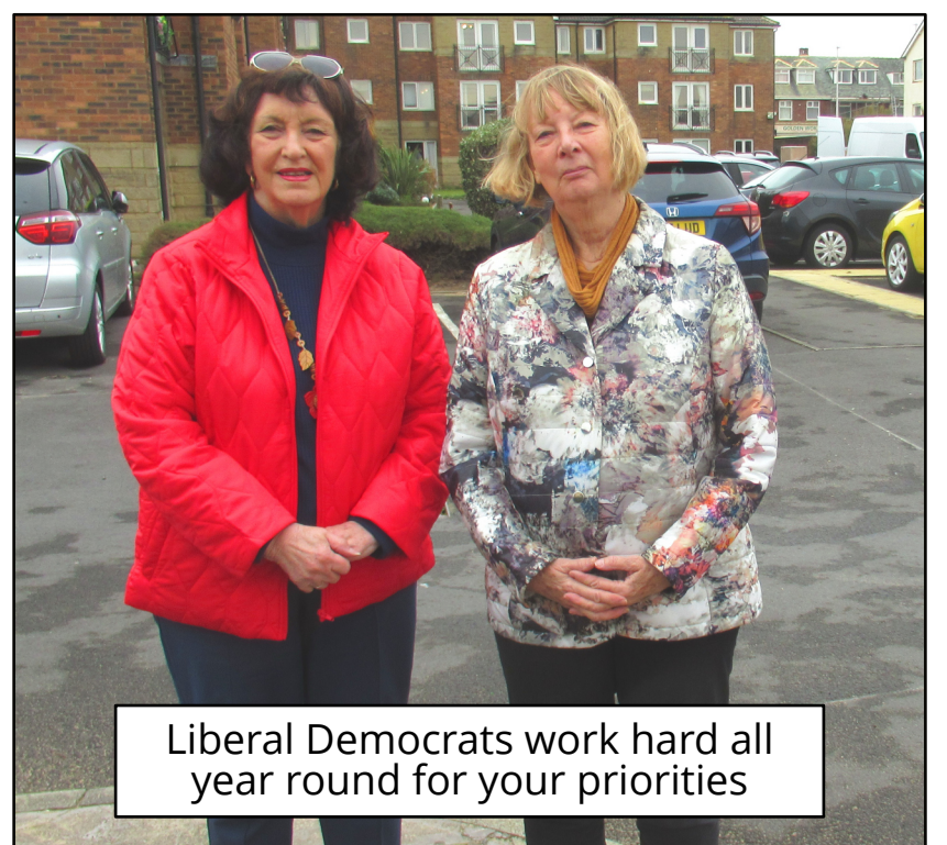
Liberal Democrats work hard all year round for your priorities

Campaigning against the disgusting dumping of raw sewage into our sea and rivers