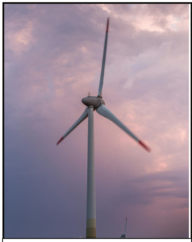
We all want the wind farm to progress, but we need an alternative cable route

You can be assured I will fight against the current proposals and push for our preferred route to bring ashore this important green energy.